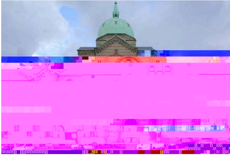
The campus we were based at.